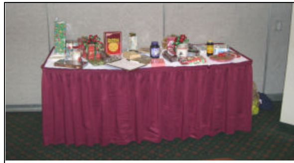
Above: Members and guests; Alzheimer's raffle table