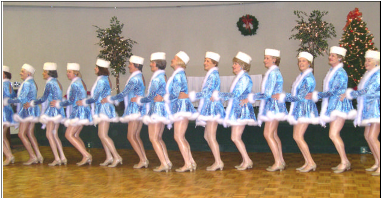
Pictures above: December 12th 'eating meeting' members, guests and So-phisticated Ladies